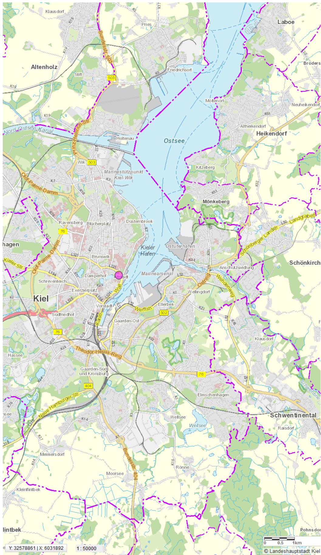
Figure 2: Location Map 1